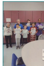
Children Receive Certificates for Club Attendance Berlin Community School