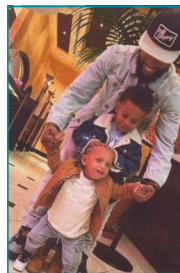
A Single Dad with His 2 Children Who Received Clothing and Food From "Bread of Life" Food Pantry. The Dad Prayed to Receive Christ.