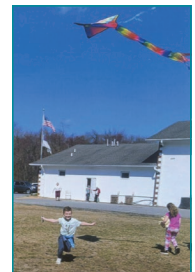
Children Fly Kites Kidets & Champions Bible Clubs Fellowship Bible Baptist Church