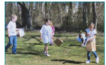
Children Have a Scavenger Hunt to Demonstrate Christ's Resurrection Kidets & Champions Bible Clubs Fellowship Bible Baptist Church